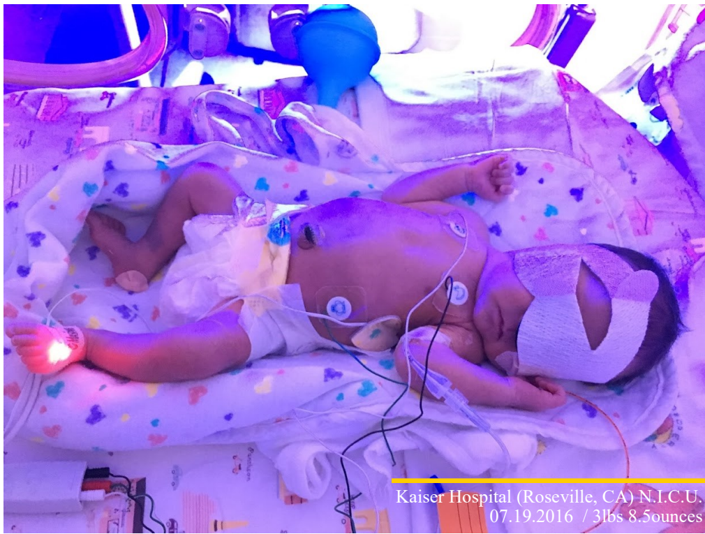
Kaiser Hospital (Roseville, CA) N.I.C.U. 07.19.2016 / 3lbs 8.5ounces

nyuam ntxiv rau wb ua zaum kawg. Xyoo 2016 Vajtswv thiaj pub ib tug menyuam koobhmoov rau wb.