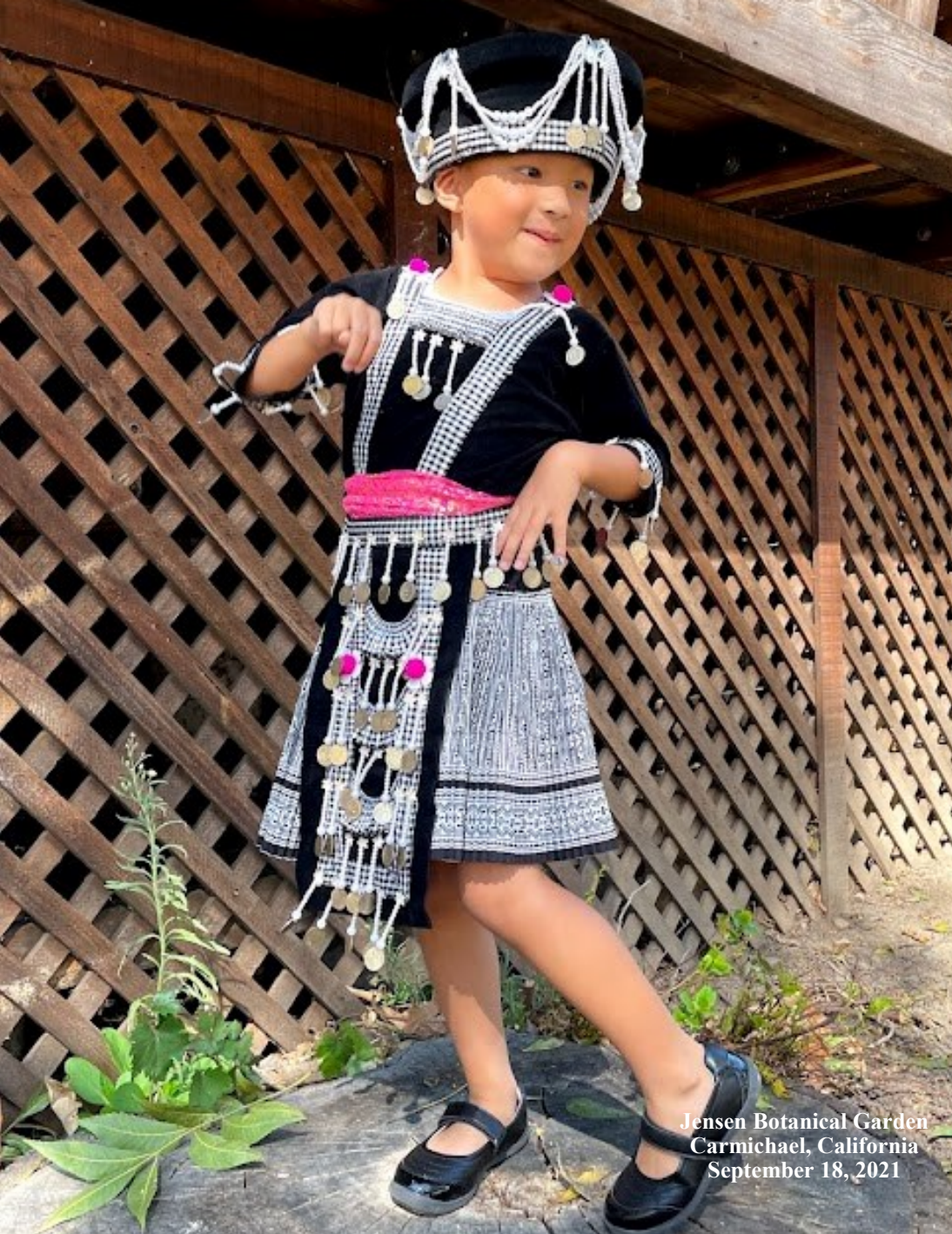
Jensen Botanical Garden Carmichael, California September 18, 2021